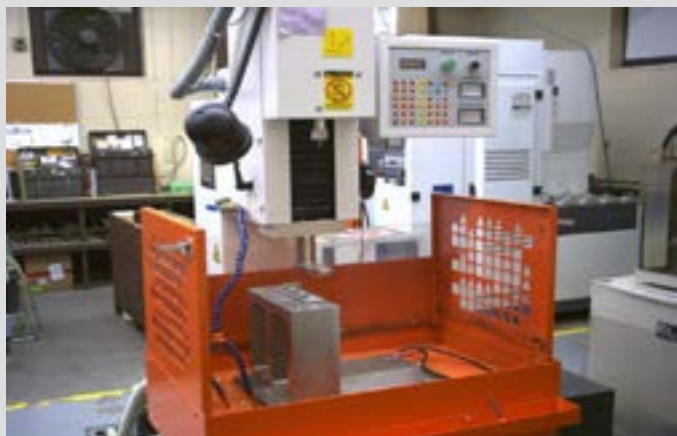
EDM Hole Popper Down to .008 Dia. Hole