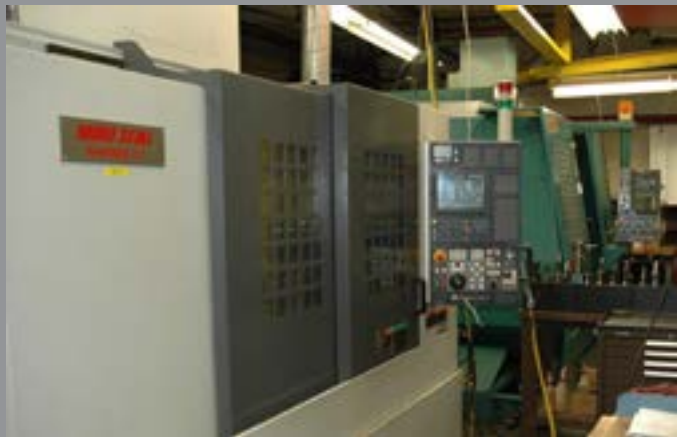
4 Axis CNC Mills