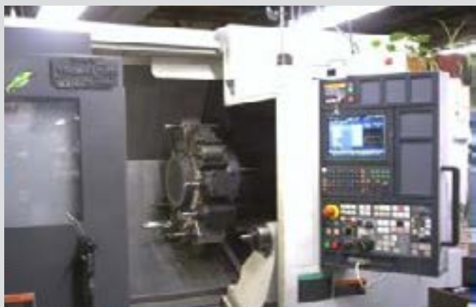
CNC Turn / Mills