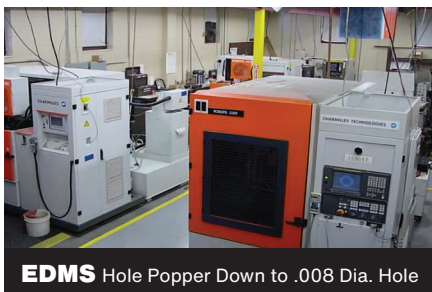
EDMS Hole Popper Down to .008 Dia. Hole

Engine Lathes Bridgeport Vertical Mills Horizontal Mills